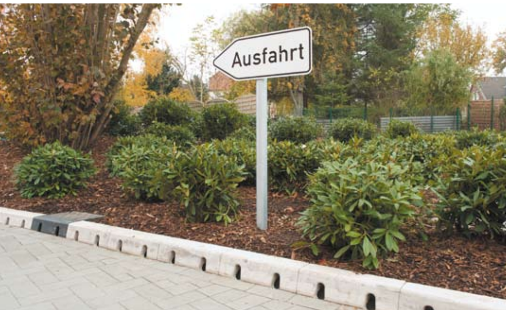
ACO DRAIN® Kerbdrain in the area of the access and exit roads and also the parking spaces

on average, covers the needs of about 200 single-family houses.