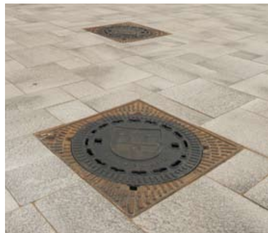
ACO Multitop manhole cover with Rendsburg's coat of arms in the entrance area of the RONDO

ACO Tiefbau Vertrieb GmbH is the specialist for professional water drainage in civil engineering, road construction and garden, landscape and open space construction: this was proved once again on the 38,000 m 2 overall area of the Rondo shopping site. For planners and firms carrying out the construction work, the use of ACO products offered great advantages: obtaining everything from one source and using products coordinated with each other and forming elements of a system. The complete product programme was used in the building of the new shopping centre: water drainage channels, manhole covers and access covers, street drains, tree-protection floor grids and tree guards, as well as separators and supply shafts. Apart from the proven and high-calibre standard products, such as the ACO DRAIN® Multiline channel systems, also used in combination with ACO Eyeleds, and ACO DRAIN® Kerbdrain, as well as the new channel system ACO DRAIN® Powerdrain, special designs were also developed in collaboration with the planners.