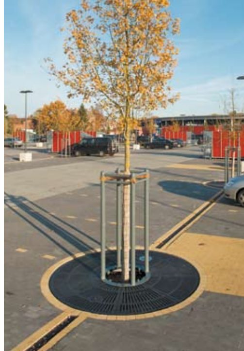
tree-protection floor grids to protect the young plants