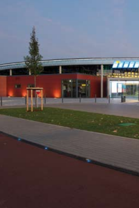
ACO DRAIN® Multiline with Eyeleds in the access area