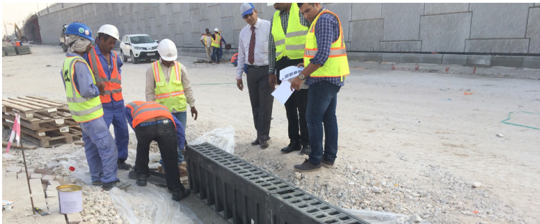
During installation in 2015